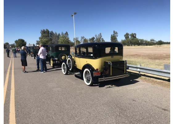
Model A's and T's,

Saturday, October 29, 15 classic vehicles, consisting of Model A's , T's , and one vintage Ford met at the Pima County Fairgrounds at 10:45 AM. At 11:00 AM we were escorted thru the grounds and parked inside a building, where we proudly displayed our vehicles. We toured the grounds and looked at the motor homes for sale. They were very elaborate and expensive. You could buy one of these or 25 model A's or T's your choice. Most of us ate together and we left the premise at 2:30 PM . It was an easy fundraiser for us and a fun time . It was a beautiful day with a high of 82°. Thank you all that came out to participate.